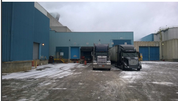
PAPER SHIPPING DOCKS STREET VIEW